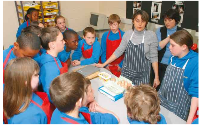
Ob allein oder in der Gruppe: Kochen und Backen kann viel Spaß machen

Die englische Küche ist besser als ihr Ruf – es gibt eine Vielfalt an regionalen und internationalen Gerichten, wobei die leckeren Nachtische besonders hervorzuheben sind. In dieser Webrecherche werdet ihr zwei typisch britische Nachtische kennen lernen, die euch sicherlich Lust auf mehr machen werden. Viel Spaß dabei!