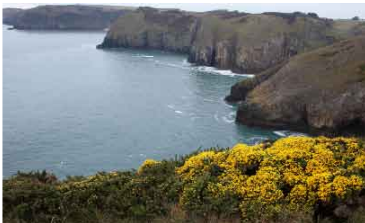
Coastline in Pembrokeshire

Wales is a beautiful country with 750 miles of coastline and 641 castles. Only 170 miles from north to south and 60 miles east to west, you are never far from the sea or mountains. In this Web activity you will learn more about getting around a Welsh national park. Have fun!