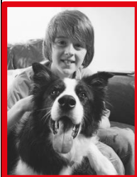
Luke and Sherlock