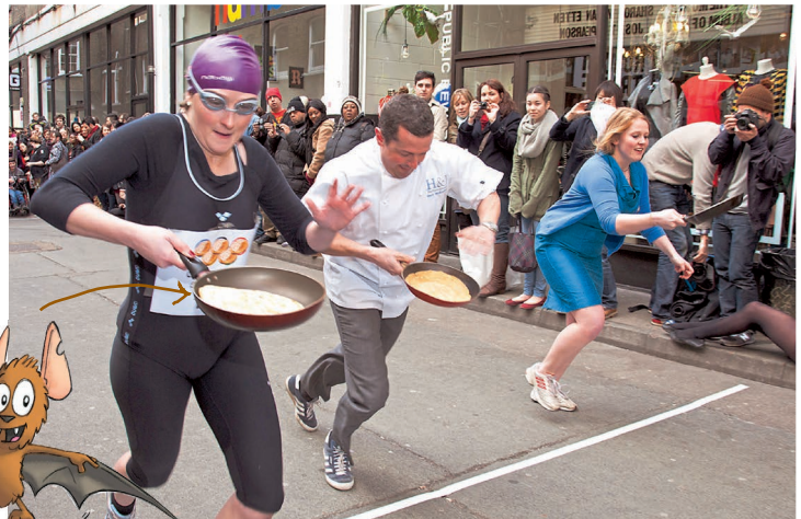
a cake in a pan = a pancake

Remember: Pictures can help you understand the text.