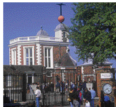
The Old Royal Observatory in Greenwich

Wisst ihr, wie sich das Vereinigte Königreich ( the UK ) zusammensetzt und wo seine Hauptstadt London liegt? In dieser Webrecherche werdet ihr auch mehr über den Londoner Stadtteil Greenwich erfahren, wo Emma, Lisa, Sam und Terry wohnen.