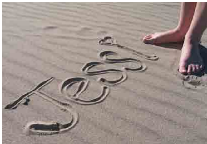
Wie Sand am Meer: Namen gibt es unendlich viele

Ihr seid schon einigen Namen in eurem Englischbuch begegnet. Außerdem kennt ihr bestimmt andere englische und amerikanische Namen: von Musikern, von Fußballspielern und anderen Sportlerinnen und Sportlern sowie von Schauspielerinnen und Schauspielern. Welche Namen sind besonders beliebt? Welchen Namen hättest du gerne? Mit dieser Webrecherche werdet ihr damit beginnen, das Internet auf Englisch kennen zu lernen. Viel Spaß dabei!