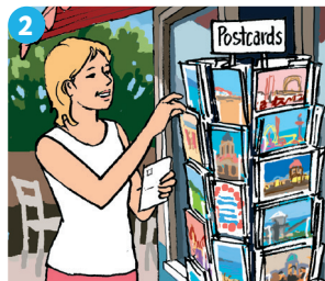
look at postcards • shop