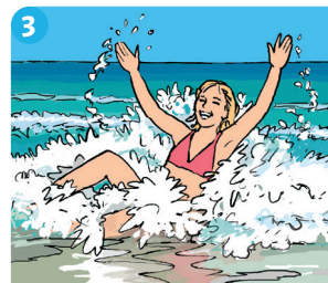
go swimming • sea