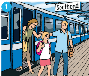
go to Margate • train