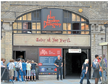
The London Dungeon