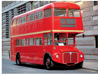
Red double decker bus