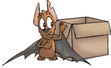
on the left