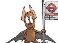
at the bus stop