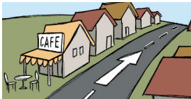
go straight on