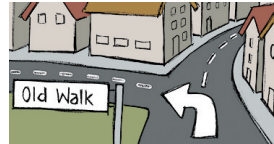
turn left take the first street on the left