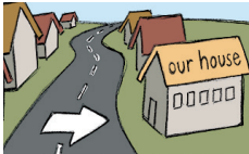
Our house is on the right/left.