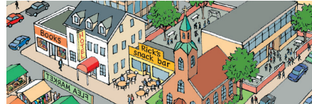
The sports shop is near Rick's Café.