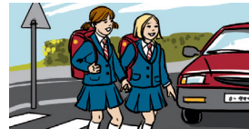
go across the street