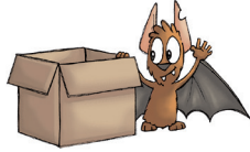
on the right