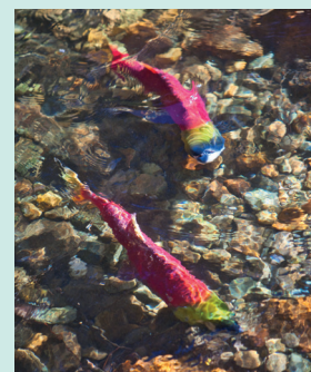
1 sockeye salmon [ˌsɒkɪˈsæmən] – Rotlachs

1 The Adams River originates at about 2,000 metres in the Monashee Mountains of British Columbia. After travelling for about 400 kilometres through several lakes and joining other rivers, the waters of the Adams River enter the Pacific Ocean just south of Vancouver. However, what makes 5 the Adams River special is the kind of fish that lives here – the sockeye salmon. These fish are born in the river and spend the first year of their life there. After that they go on a challenging 2,000 kilometre journey to the Pacific Ocean. Three years later they return to where they were born, and it only takes them 17 days. This demanding return journey is a wonder of nature and it's almost like 10 parkour for the fish as they swim against the water in the rivers and even jump up waterfalls. Along the way the fish stop eating and change color from green to bright red. When they get back, they lay eggs and then the adult fish die. For some unknown reason every four years the number of salmon that return is especially large – millions. In 2010 scientists guessed there were about 34 million. 15 In other years it is only hundreds. The next big years are 2022 and 2026. During these years the salmon will fascinate up to 200,000 tourists who come to the area who watch and learn about them.