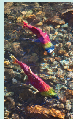
1 sockeye salmon [ˈsɒkiɪˈsæmən] – Rotlachs

1 The Adams River runs from the Monashee Mountains in British Columbia to the Pacific Ocean, but what makes this river so special is a kind of fish that lives there – the sockeye salmon. These fish are born in the river and spend the first year of their life there. After that they go on a challenging 2,000- 5 kilometres journey to the Pacific Ocean. Three years later they return to the river where they were born, and it only takes them 17 days. This demanding return journey is a wonder of nature. The fish have to swim up the river and even jump up waterfalls. Along the way the fish stop eating and change color from green to bright red. At the end of their journey they lay their eggs and die. 10 Nobody knows why, but every four years the number of salmon that return is really large – in the millions. In 2010 there were about 34 million. In other years it is only hundreds. The next big years are 2022 and 2026. During these years the salmon will fascinate up to 200,000 tourists who come to the area to watch them.