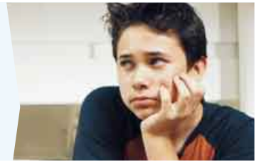
2 Adrian [ˈeɪdriən]

■ Adrian 2 , 15 Boys commit suicide more because they don't tell people when they're ticked off, "big boys don't cry" kind of thing.