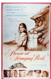
Picnic at Hanging Rock (1975)