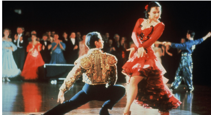
Made in Australia and a hit around the world: Strictly Ballroom (1992)

Imagine that your school decides to have an 'Australia Week'. The Biology classes are planning to do various projects on the animal world, and the English classes have been asked to organize a 'mini film festival' with four films. But which ones are you going to show?