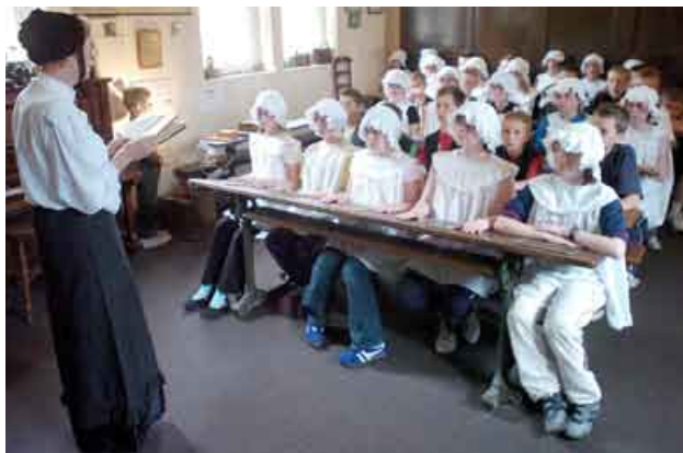
Junge Touristen bekommen ein Gefühl für den Schulalltag vergangener Zeiten

In Unit 1 hat euch Tina interessante Fakten über Schulen in der Vergangenheit erzählt. Aber es gibt noch viel mehr darüber zu erfahren! Im Internet gibt es viele Websites mit Bildern, die zeigen, wie die Situation in Schulen zu verschiedenen Zeiten war. Ein paar dieser Websites warten jetzt darauf, von euch entdeckt zu werden.