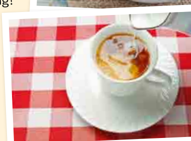
English tea with milk

The most popular breakfast drink is tea - strong, with milk and perhaps sugar. Coffee (often instant) and fruit juice are also popular at breakfast time.