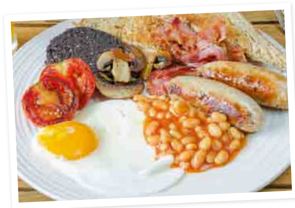
A 'full English'