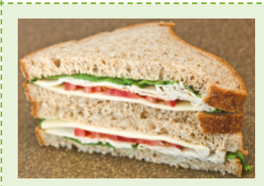
go on a mountain climbing tour | take some sandwiches

If I go to Cornwall, I will try surfing.