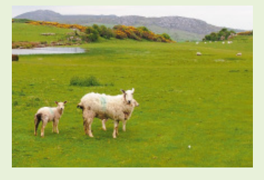
spend some time in Wales | see lots of sheep