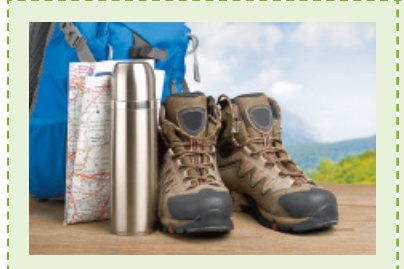
want to go hiking | wear good shoes

If you need information about Scotland, you can write to a tourist board.