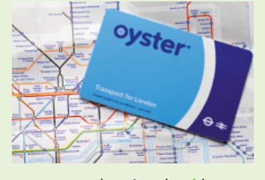
want to explore London | buy an Oyster card