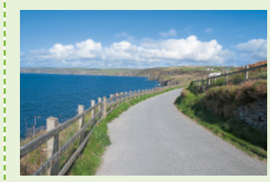
drive along the coast | see the most beautiful landscapes