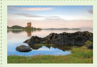
go to Loch Ness | not be scared of the monster

If you want to go hiking, you should wear good shoes.