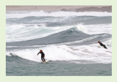
go to Cornwall | try surfing

If you're interested in Celtic languages, you can learn some Cornish.