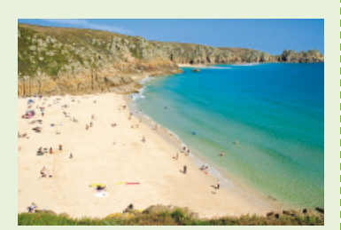
like sandy beaches | find them in Cornwall

If you want to relax, you shouldn't go to an outdoor centre.