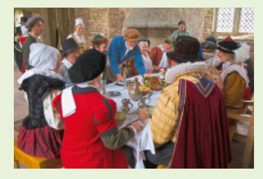
visit a castle in Wales | watch a 'living history' show

If you like sandy beaches, you can find them in Cornwall.