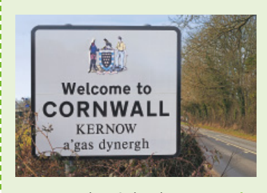
interested in Celtic languages | earn some Cornish

If you travel from London to Cornwall, it will be cheaper to take the train.