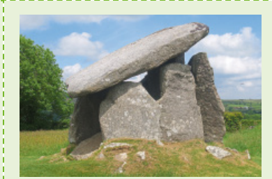
go to Bodmin Moor | visit some prehistoric monuments

If you don't like hotels, you can stay on a farm.