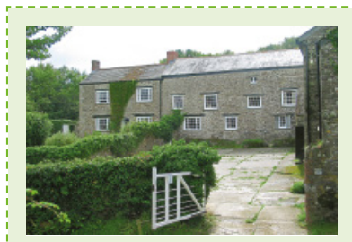
not like hotels | stay on a farm