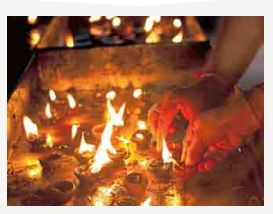
Small oil lamps called 'diyas'

There's always an exciting programme of events with traditional music, dance and shows. People can see and try on colourful traditional costumes and get traditional Indian henna make-up or hairstyles. Of course there's lots of typical food too.