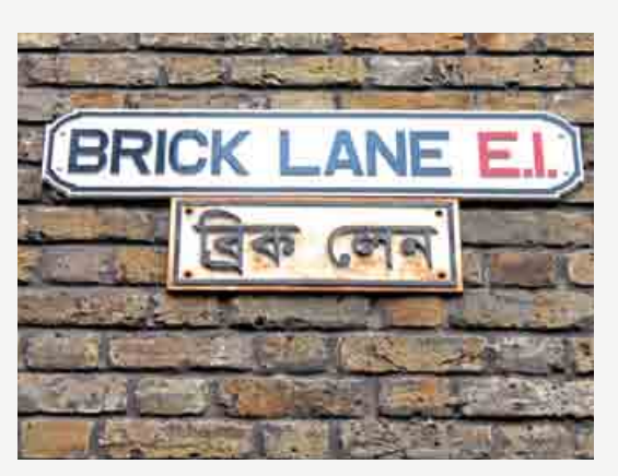
Street signs in Brick Lane

Every Sunday there's the Brick Lane Market, a traditional flea market. Here you can buy everything from vintage clothes to magazines and CDs and all kinds of food and snacks.If you're looking for cool vintage outfits, you can also find a bargain at one of the cool shops.