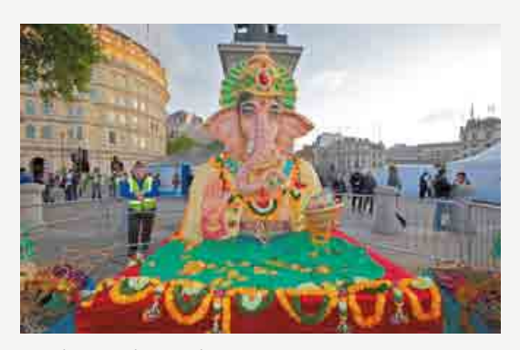
Diwali Festival in London