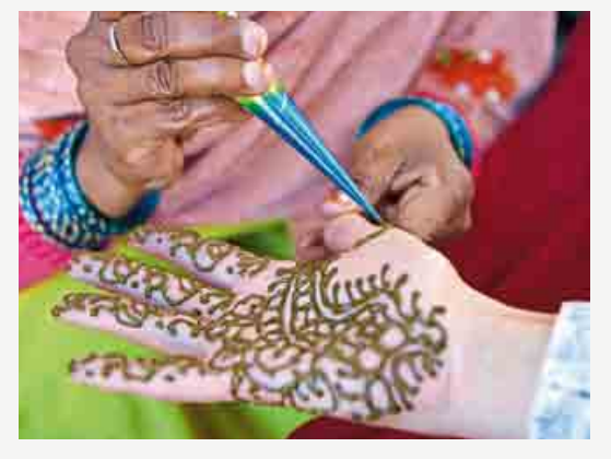
Traditional henna make-up

celebration [selə'breɪʃn] Feier O Diwali [dɪ'wɑ:li] O Hindi ['hɪndi:] Hindi O row [rəʊ] Reihe O lamp [læmp] Lampe O Hindu ['hɪndu:] Hindu; hinduistisch O victory ['vɪktəri] Sieg O evil ['iːvəl] das Böse O darkness ['dɑ:knəs] Dunkelheit O symbol ['sɪmbl] Symbol O religion [rɪ'lɪdʒn] Religion O programme of events [,prəugræm_əv ı'vents] Veranstaltungsprogramm O traditional [trə'dɪʃnəl] traditionell O hairstyle ['heəstaɪ] Frisur