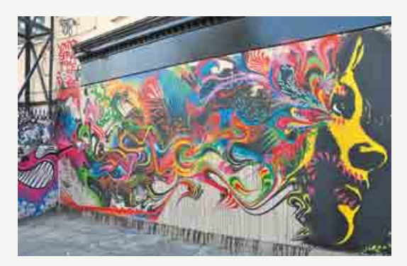
Street art in Brick Lane